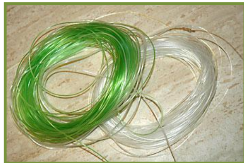
Monic's Tropical Seamless Phantom Tip line (left) and their new Tropical FST Bonefish Taper (right).

Bob Goodale's determination and extensive chemical background provided the world's first and only clear floating fly line. Floating lines are popular because they are easier to pick up and cast when the need arises for a quick re-cast. The intermediate's slow sink rate requires it to be stripped in much further before picking up for another cast.